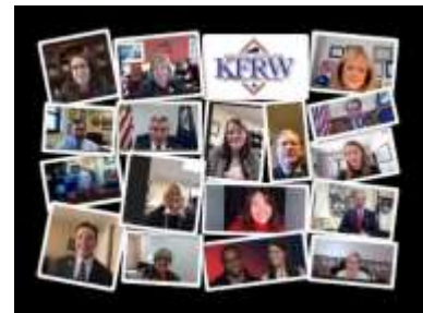
Legislative Day 2021 Collage of Speakers