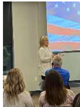
KFRW President speaks to the Madison County Republican Party