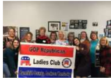
GOP Republican Ladies Club of Breathitt Co.