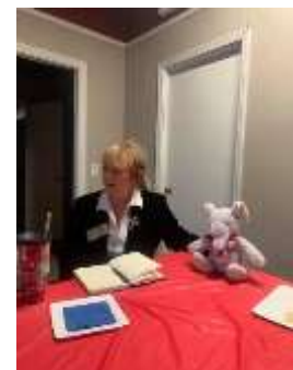
KFRW President Speaks in Estill County