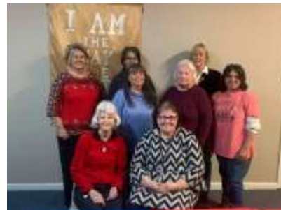
Republican Women in Estill County